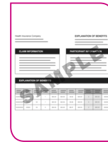
Explanation of benefits from the patient's health insurer