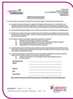
LIBTAYO Surround Healthcare Provider Representation Form (one time only)