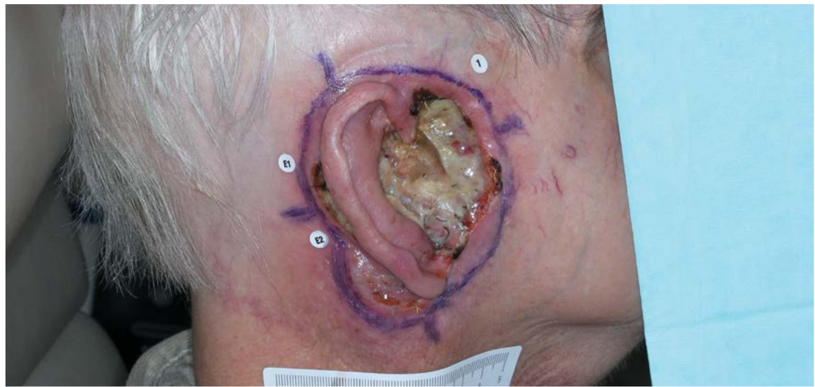
Actual clinical trial patient.