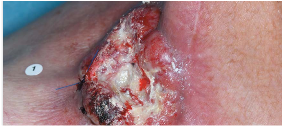
Actual clinical trial patient.